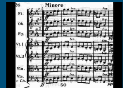
Haydn: Symphony No.94