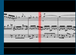
Bach: "Little" Fugue